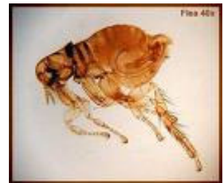
A magnified image of a flea