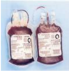
Fresh blood after donation.

Peak Vets recently became the first veterinary practice in the country to host a blood donation day in conjunction with Pet Blood Bank UK, an animal blood donation charity.